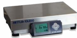
External Scale (optional)