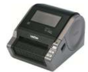
Label Printer (optional)