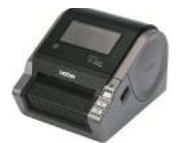
Label Printer (optional)