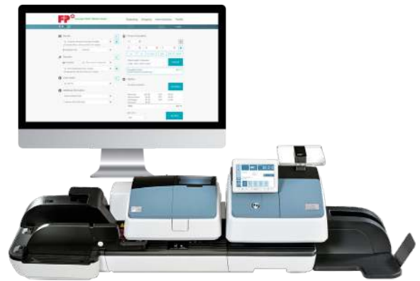
Vision A5 Shown