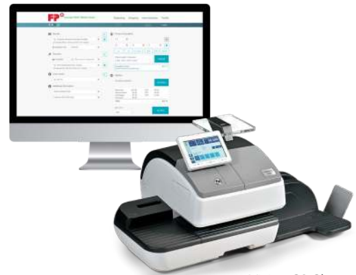
Vision S3 Shown