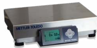
External Scale (optional)