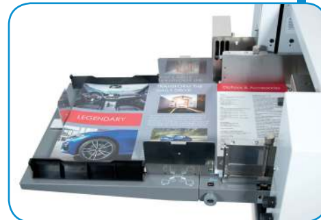
Extended Infeed Tray with Air Suction Feeder: Handles sheets up to 25.5" long, using both optical and ultrasonic sensors for accurate sheet feeding