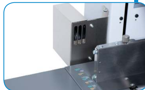
Side Air System: Enhances feeding of heavy stock and large paper sizes