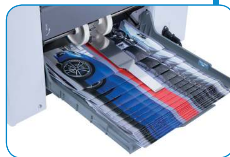
Out-feed Stacking Belt & Rollers: Automatically adjusts to paper size, with two tray positions available.

Formax - New Hampshire, USA www.formax.com