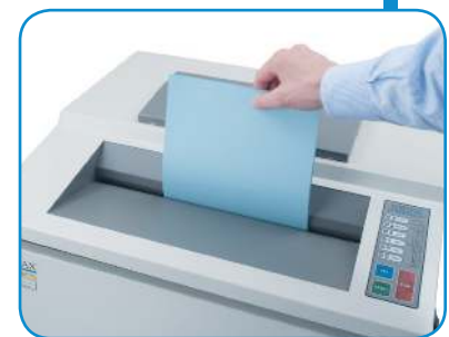
Standard Infeed accommodates up to 24 sheets at once

Formax – New Hampshire, USA www.formax.com