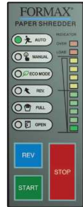
Easy-to-use control panel with Load Indicator and ECO Mode

* Sheet capacity varies depending on paper and power supply