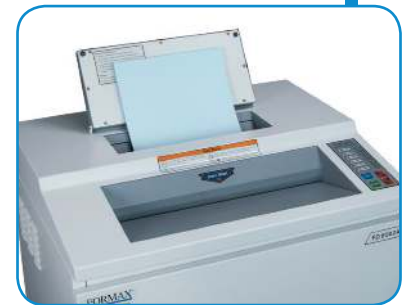
Dedicated AutoFeeder holds up to 175 sheets