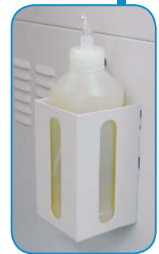
Optional EvenFlow™ Automatic Oiling System

Formax – New Hampshire, USA www.formax.com