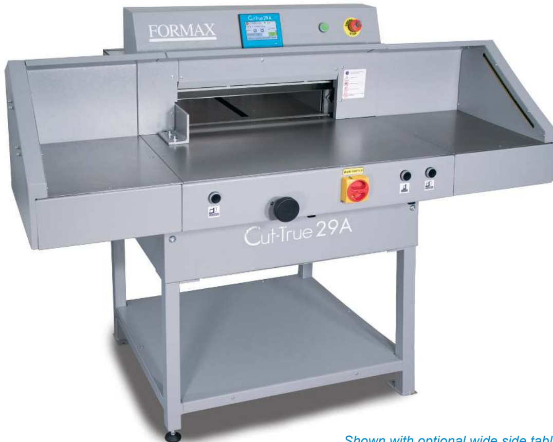
Shown with optional wide side tables

The Formax Cut-True 29A Electric Guillotine Paper Cutter offers precision cutting for paper stacks up to 20.5" wide. User-friendly, intuitive features include a touchscreen control panel, automatically-adjusting back gauge and the capacity to program up to 100 jobs/100 cuts . An infrared light beam safety curtain provides safety and convenience as it shuts down operation if the light plane is interrupted.