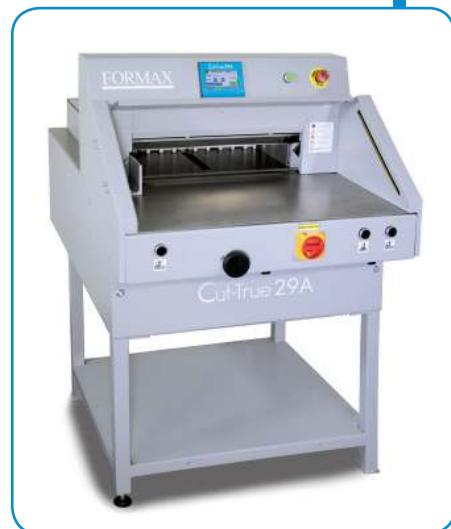
Standard model, without optional wide side tables

Formax – New Hampshire, USA www.formax.com