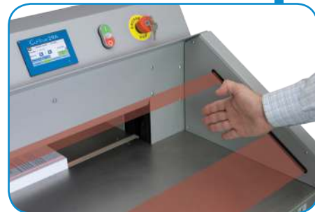
Infrared Safety Curtain shuts down operation if the beam is interrupted