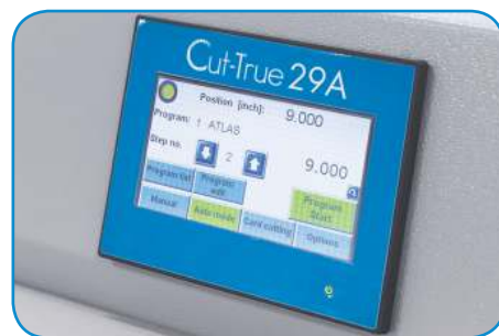
Full-color touchscreen control panel allows for programming up to 100 jobs

* 31"W with safety curtains removed for easier transport through doorways. 33.5"W including safety curtains.