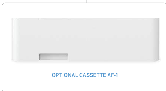
OPTIONAL CASSETTE AF-1