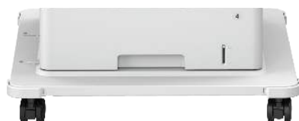
OPTIONAL CASSETTE FEEDING UNIT-AV1 (Up to one additional)