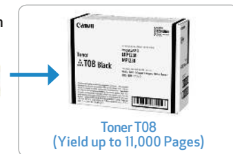
Toner T08 (Yield up to 11,000 Pages)

Use of Canon GENUINE toner cartridges helps provide longer equipment life, high yields, reliable performance, high-quality output, and minimal jamming or issues.