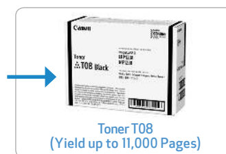
Toner T08 (Yield up to 11,000 Pages)

Use of Canon GENUINE toner cartridges helps provide longer equipment life, high yields, reliable performance, high-quality output, and minimal jamming or issues.