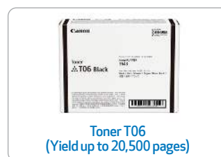
Toner T06 (Yield up to 20,500 pages)

Use of Canon GENUINE toner cartridges helps provide longer equipment life, high yields, reliable performance, high-quality output, and minimal jamming or issues.